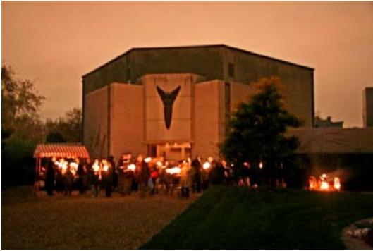
Fig. 8: Walking with candles at De Nieuwe Ooster.