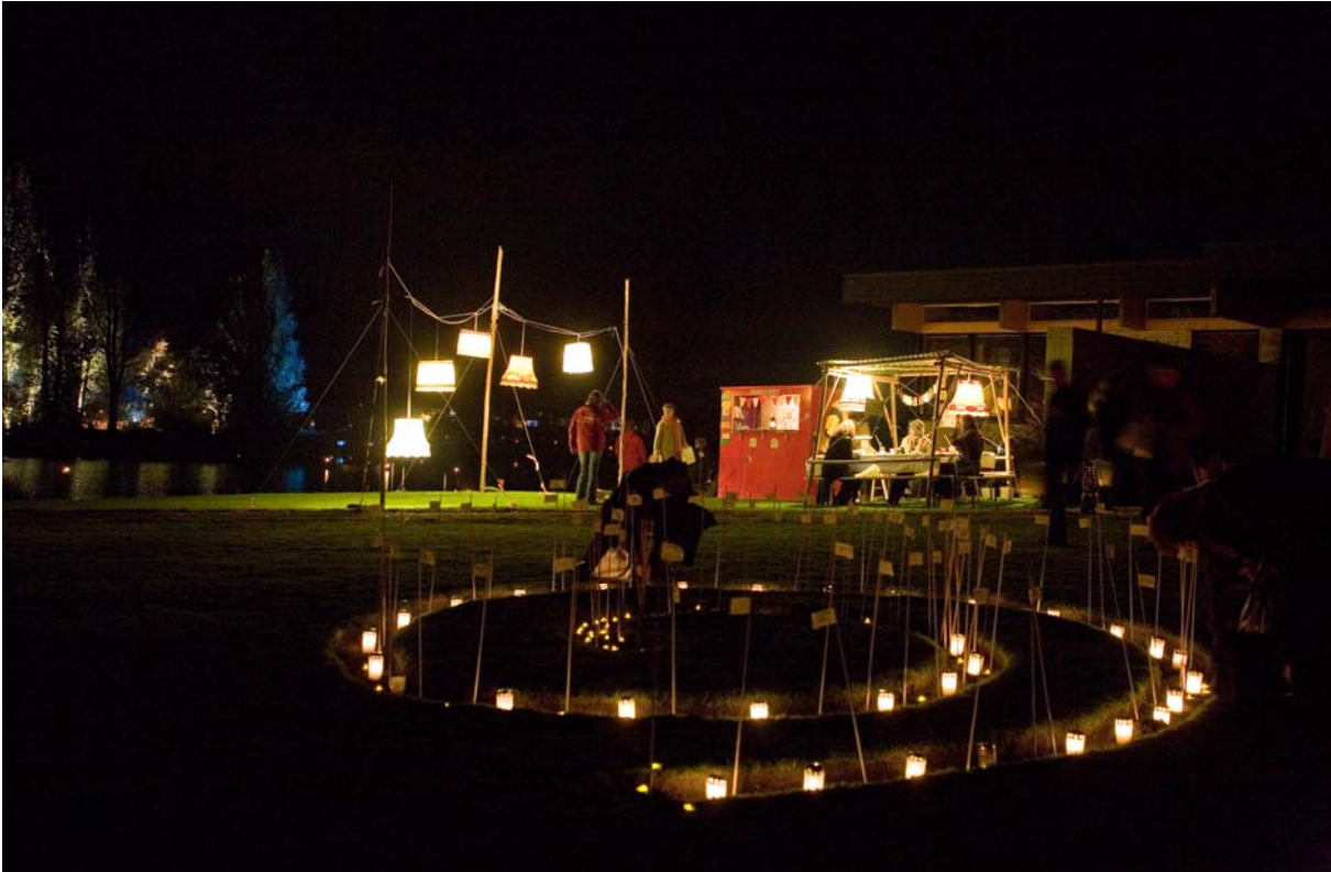
Fig. 6: Planted flower bulbs in Schagen.