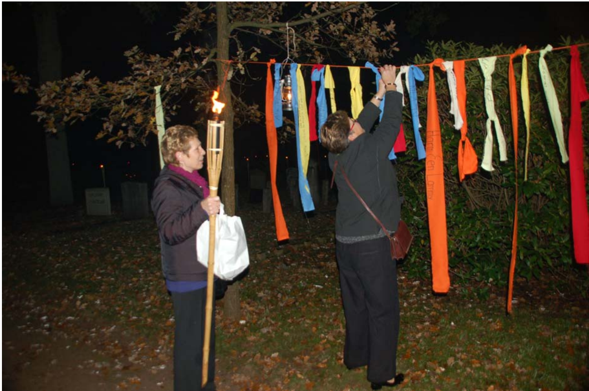
Fig. 13: Hanging up Ribbons in Apeldoorn. Photograph taken by Ida van der Lee (2008)