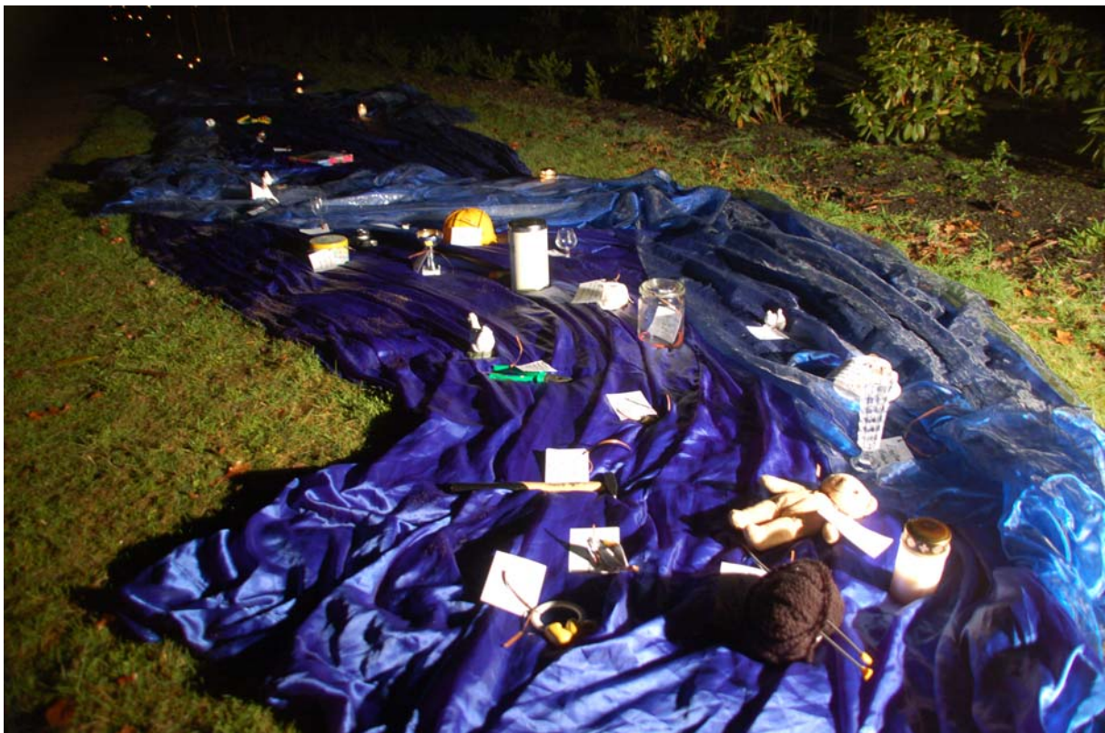
Fig. 14: Golf van Herinnering in Apeldoorn. Photograph taken by Ida van der Lee (2008)