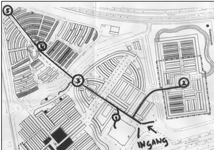
Fig. 10: Map handed out in Alphen aan den Rijn 2008