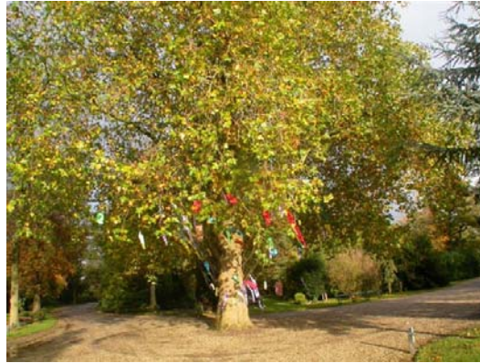
Fig. 2: Walking with candles at De Nieuwe Ooster.

visited as the following year when many people, full of emotions, called others to convince them to come as well, and in the end four thousand visitors were counted. That year they also handed out small candles with paper holders so that people could walk around with them. The idea had come from Bert Hilhorst, a sacristan working in conjunction with De Nieuwe Ooster, and was inspired by the candles used in processions in Lourdes, although here the name of the celebration and the logo of the park were put on the paper holder instead.