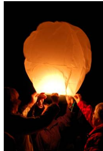
Fig. 11: Letting up a Thai Sky Lantern.