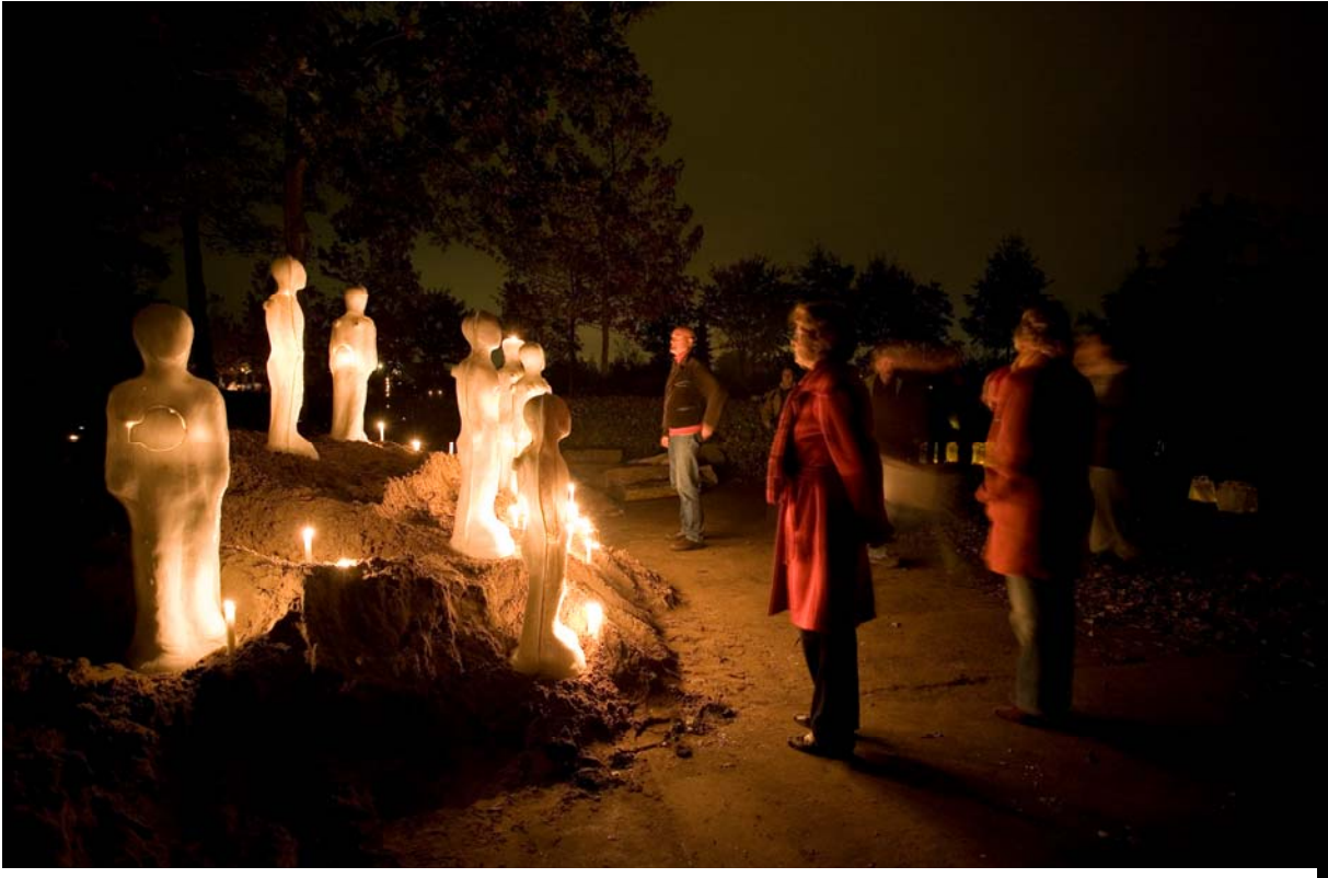
Fig. 3: Paraffine Statues in Castricum.