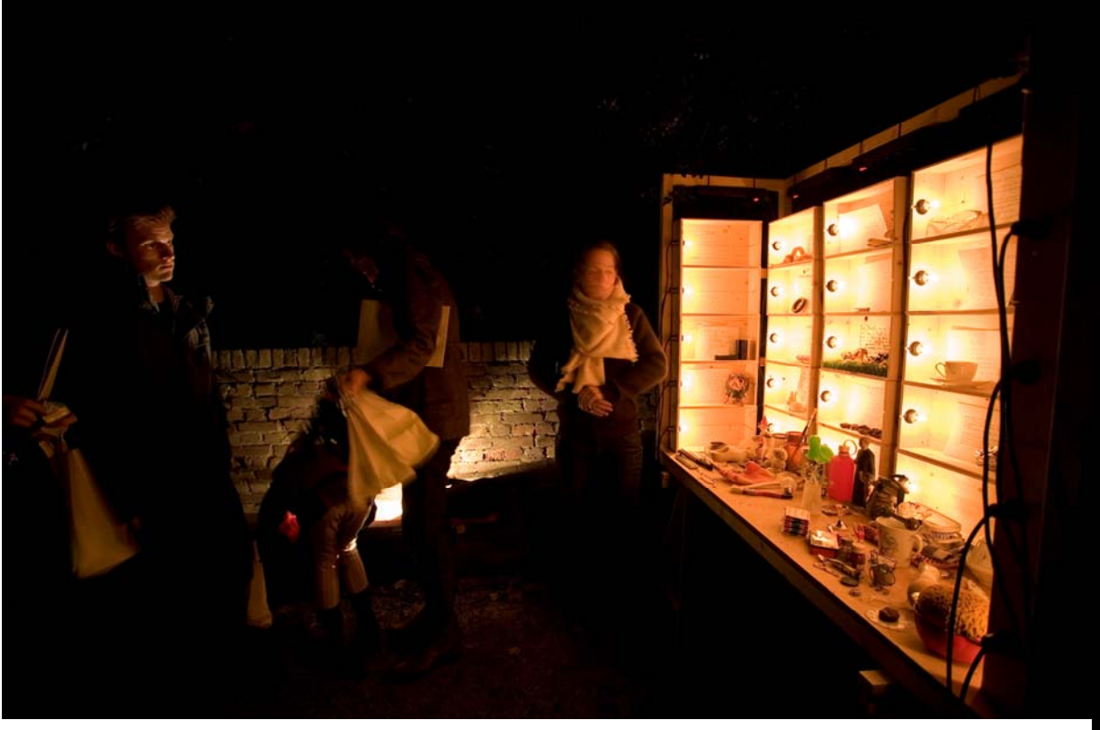
Fig. 5: Herinnerdingen. Photograph taken by Max Linsen (2007).