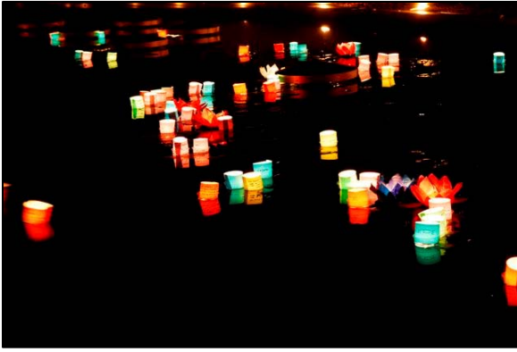
Fig. 1: Floating Lights at De Nieuwe Ooster.