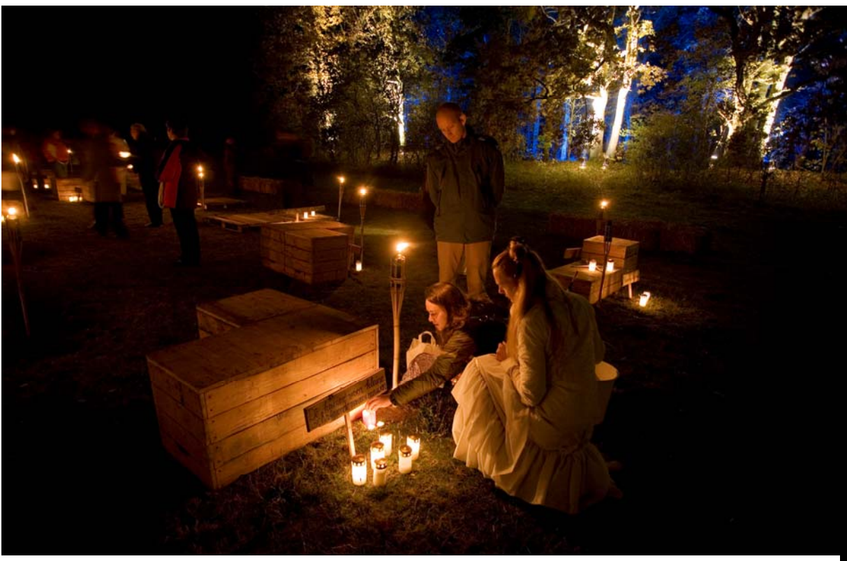
Fig. 4: Hiernamaals in Castricum. Photograph taken by Max Linsen (2007).