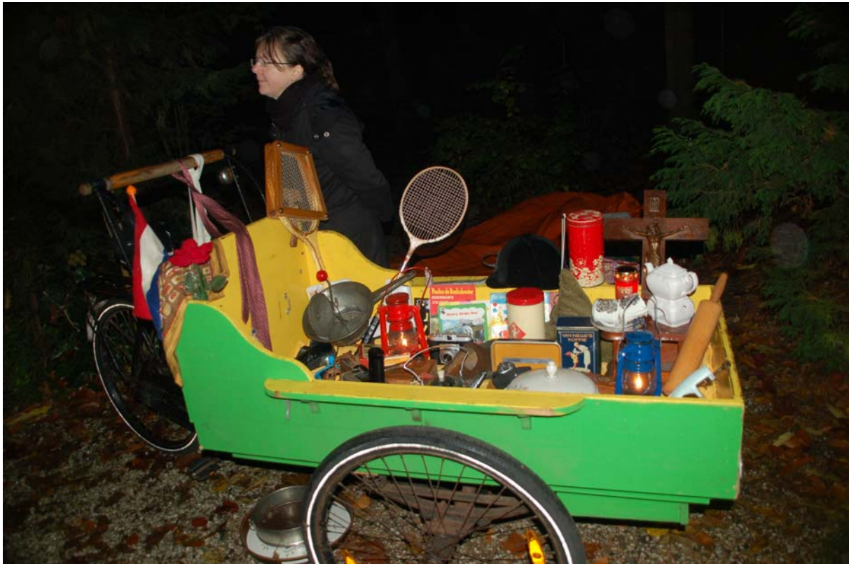
Fig. 15: Herinnerdingen in Castricum. Photograph taken by Ida van der Lee (2008)

help. She also explained to me that her idea had been inspired by the fact that the ink of drawings placed on graves often runs but that she told people to with the disks as they pleased. Some of them had already been placed at a large stone standing by the pond, while others had decided to burn the disk instead. A version of the Herinnerdingen was also present, with the objects placed on a carrier cycle and a nearby table (see figure 15). The objects could not be put on display however, nor could messages be written, and although stories still came up, people tended to stay for a much shorter time, probably because they had nothing to write or read. Close by there was also a stand where a man was giving a workshop in painting and making poetry, which was especially popular with young children. At the poetry-doors described in the introduction, a man was playing a guitar while people walked in between the doors to read the poem or stood by one of the fire baskets to talk to friends or family. Finally, at the centre of the graveyard, room was made to drink hot wine or chocolate and sit on hay bales. Here, a light stand was also located.