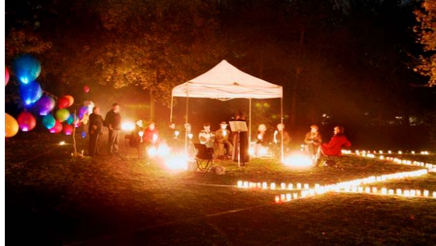
Fig. 9: Creating a star at De Nieuwe Ooster.